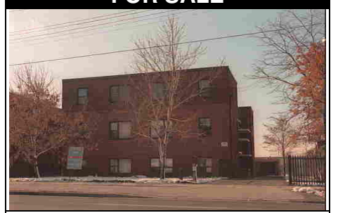
NORTH YORK, 11 units in good rental area. Only $939,000.