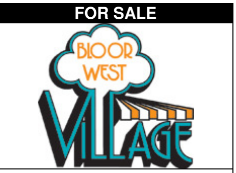
Building and Established Pastry Business. Asking $2,350,000