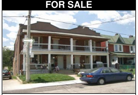
TORONTO EAST, 12 suites, Fire Sale! Retrofitted. Asking $849,000