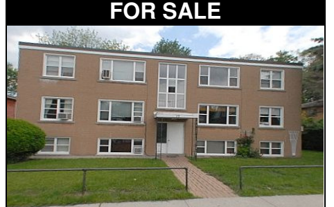
OSHAWA, 9 units, well managed, fully occupied. Asking $729,000