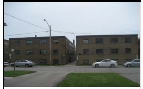
TORONTO, 52 suites, 2 blocks from lake, Low Vacancy $3,650,000