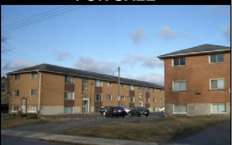
KITCHENER, 36 units, 2 buildings, good potential. Asking $1,980,000