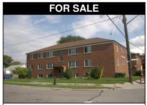
TORONTO EAST, 12 units, New windows, Retrofitted. Only $845,000